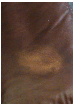
Damaged two tone