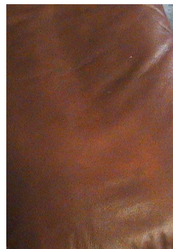
Red Brown Tinted Finish in a Can top coat applied