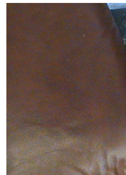
The finished repair